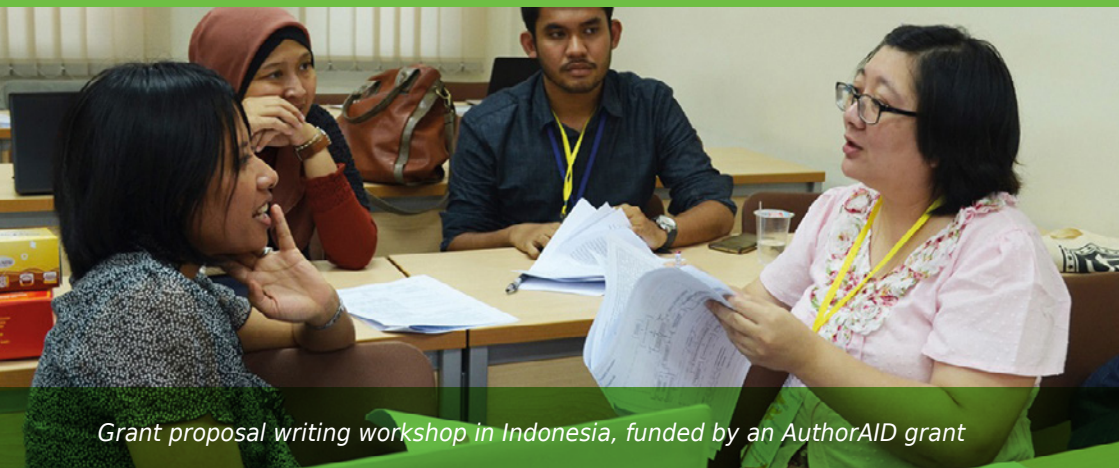
Grant proposal writing workshop in Indonesia, funded by an AuthorAID grant

Founded in 1992, INASP is an international development charity working with a global network of partners in Africa, Latin America and South Asia. In line with the vision of research and knowledge at the heart of development, INASP works to support individuals and institutions to produce, share and use research and knowledge, which can transform lives.