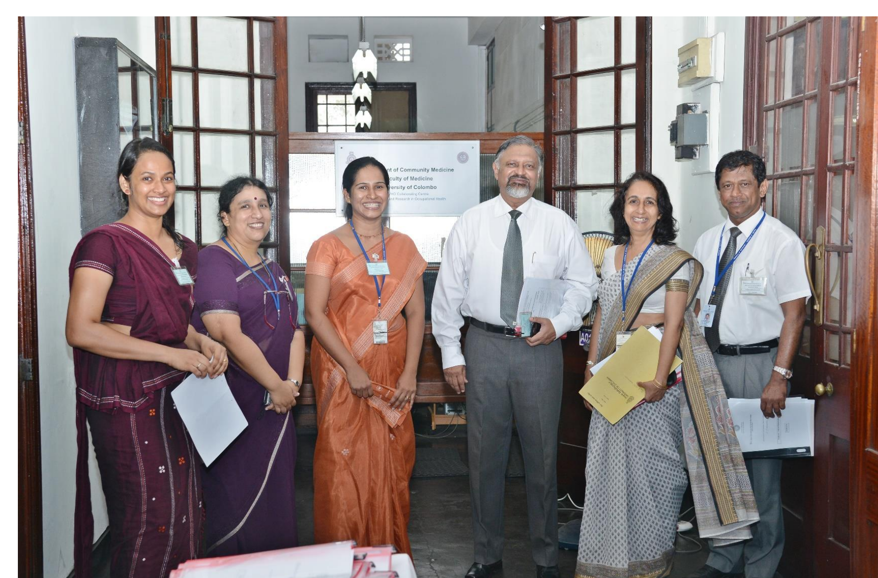
RPFC team with former Dean and a fellow academic

To improve on-line learning facility and to make it available for all the researchers in Sri Lanka on a fee-levying basis.